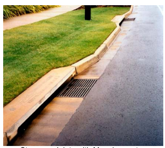
Stormway Inlets with Manning grates

Stormway inlets are markedly more pedestrian safe than other inlets as regards kerb line setback, with Drainway the next best - particularly so with barrier kerb and channel. Stormway inlets with the Manning grate and Drainway inlets with the Mannflow grate, each with slot widths of 17mm, are standout choices for the CBD, carparks, townhousing and residential areas.