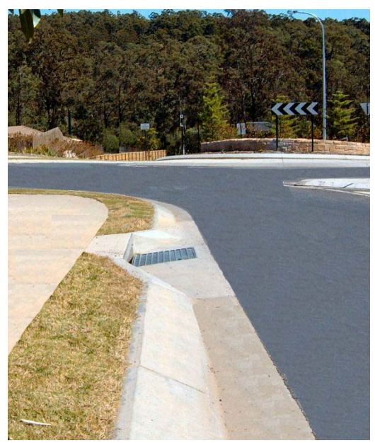
IPWEA Dwg D-0060 Inlet

Where a grate is wider than the channel then it will intrude into either the pavement or the footpath or both. Pavement intrusion has long been accepted as normal but in recent years designs have appeared eliminating pavement intrusion by pushing the pit back so that its outer wall aligns with the lip of the channel creating an intrusion into the footpath. Such designs are called lipin-line inlets. For a grate aligned with the inside of a 150mm pit wall the grate is pushed back to 150mm behind the lip line. An alternative arrangement is to align the edge of the grate with the channel lip which allows lintel setback LS and therefore the kerb setback KS to be reduced by some 150mm. Typical arrangements are shown below.