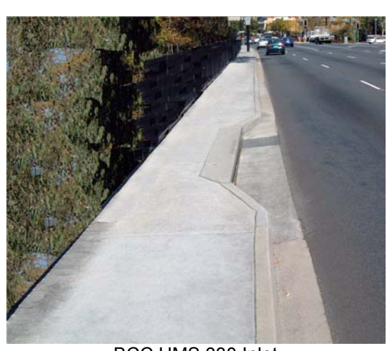
BCC UMS 330 Inlet

Setback KS is without doubt a hazard for pedestrians exposing them to a sudden and unexpected drop DD on or too close to possible paths of travel. Lip-in-line configurations have resulted in damages claims based on a contention the design exposes pedestrians to risks that constitute an unacceptable hazard. For that reason designs that reduce kerb setback and the depressed depth are to be preferred. This is best achieved firstly by reducing the width of grate GW, secondly by placing the edge of the grate on the lip line and thirdly by reducing the kerb opening height, KO. Dimensions for some commonly available inlets are set out below